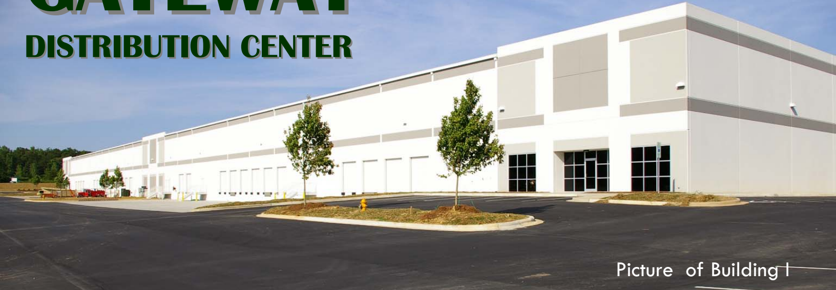
Picture of Building 1